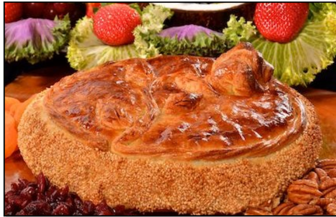
A Baked Brie en Croûte